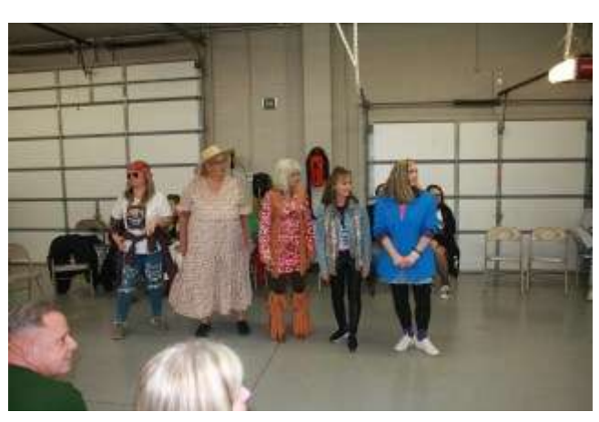
Women's costume contest