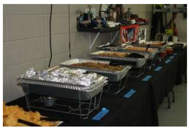
Delicious Mexican food was catered by Fiesta Time Amigos