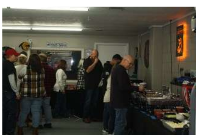
Time to eat