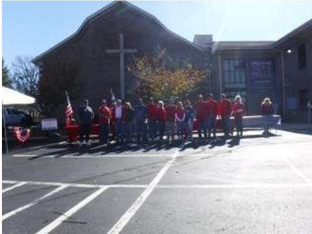
Club presenting check to the Harrison County Veterans