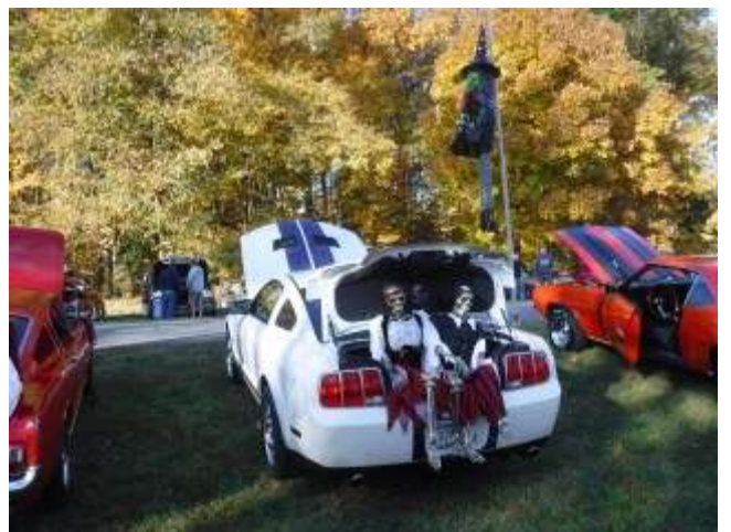
Garry and Pam sitting in their trunk waiting for trick or treaters