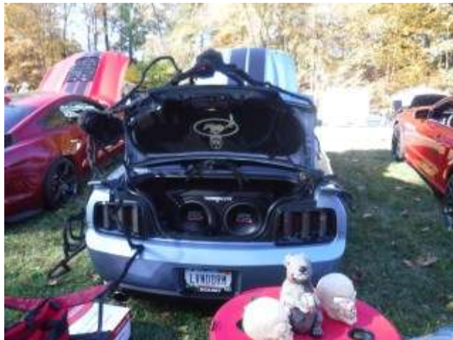
Scott's been invaded by spiders