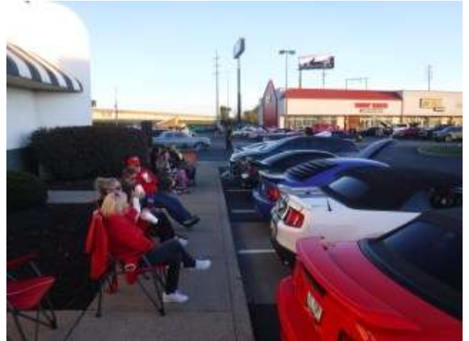
Hanging out on a nice November evening