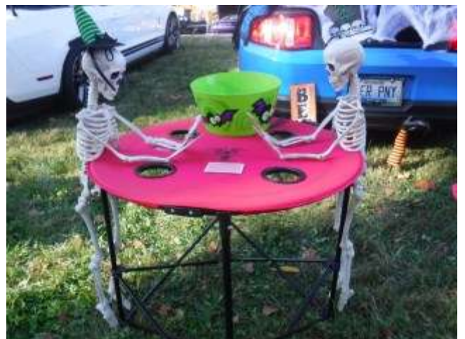
Friendly game of cards, or is it?