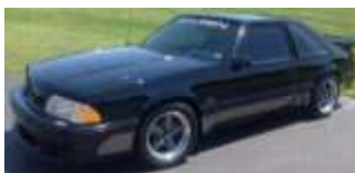
Lewie & Amy Allen - 1990 Mustang Saleen #157 - Scottsburg, IN