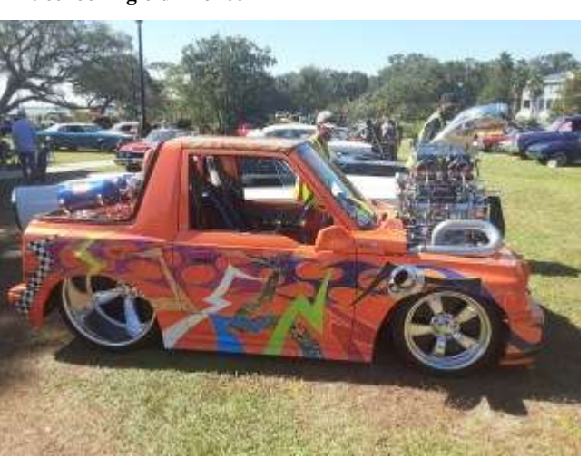
Life size Hot Wheel