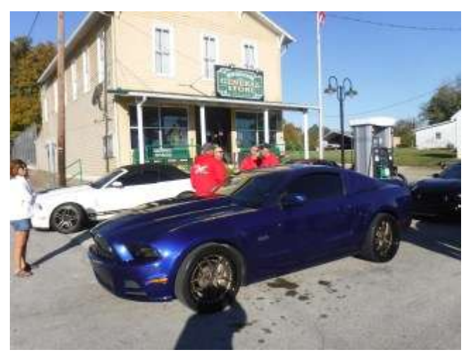
Stop at the Laconia General Store