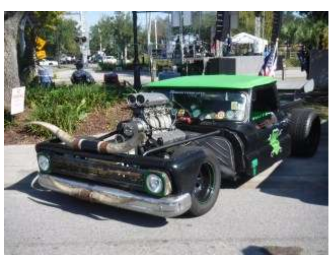
Lots of great looking rat rods