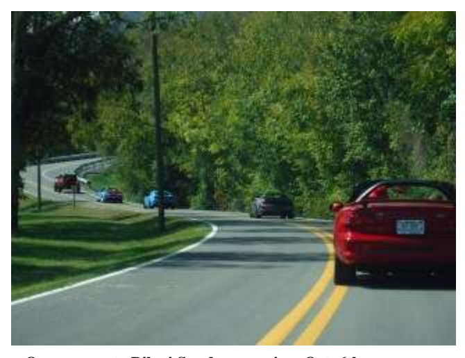
On our way to Biloxi Sunday morning, Oct. 6th

October 6-12th several FCMC members traveled to Gulfport MS to attend the 2024 Crusin' the Coast along the Mississippi coastline from Pascagoula to Bay St Louis. Beautiful weather all week nd lots of beautiful and not so beautiful cars, trucks and anything with wheels. The parade of Monday was great with 600 participants traveling along the parade route throwing out candy, trinkets, beads and stuffed animals. We had lots of good food all week. We met up with some of the Biloxi Mustang Club members, going out to eat at Sicily's Pizza and going to Pascagoula to hang out for their cruise-in on Friday. Some traveled back Friday so they could attend the DCMC show on Saturday, others just meandered back Saturday making it home Sunday night.