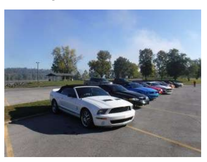
Stopped at the Waterfront Park in Brandenburg, KY