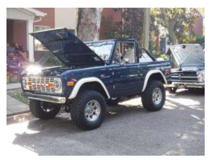
Nice looking old Bronco