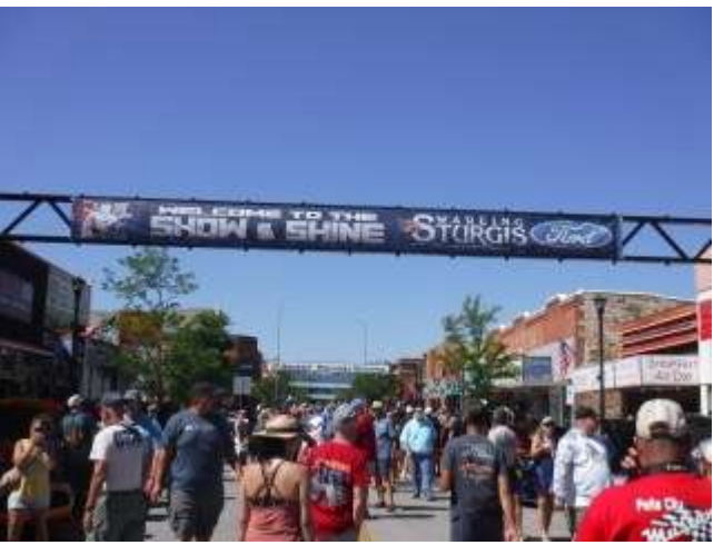
We were parked on Main St