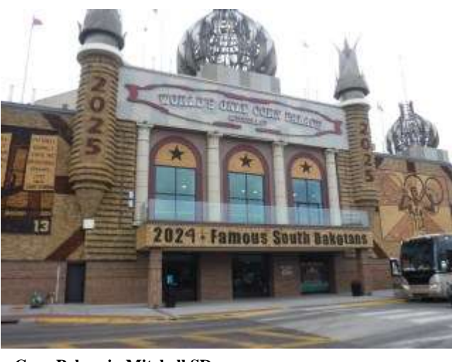
Corn Palace in Mitchell SD