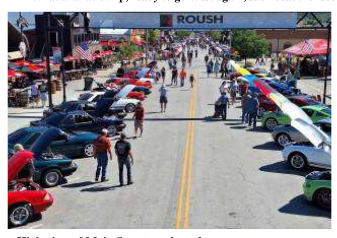
High view of Main Street on show day

What a fanatic trip, ready to go West again, such beautiful scenery!!!