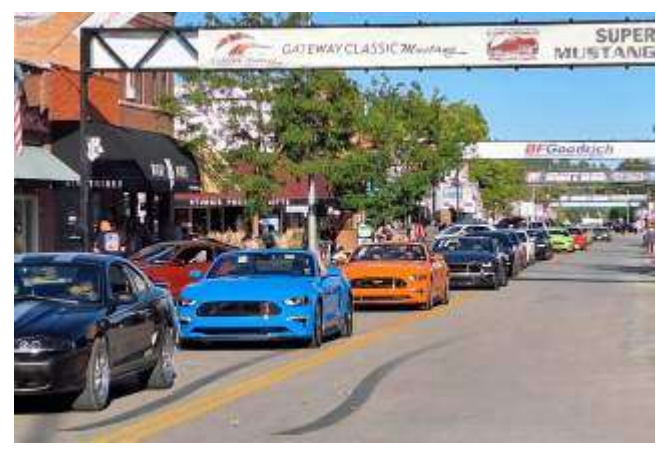
Parade down Main St in Sturgis