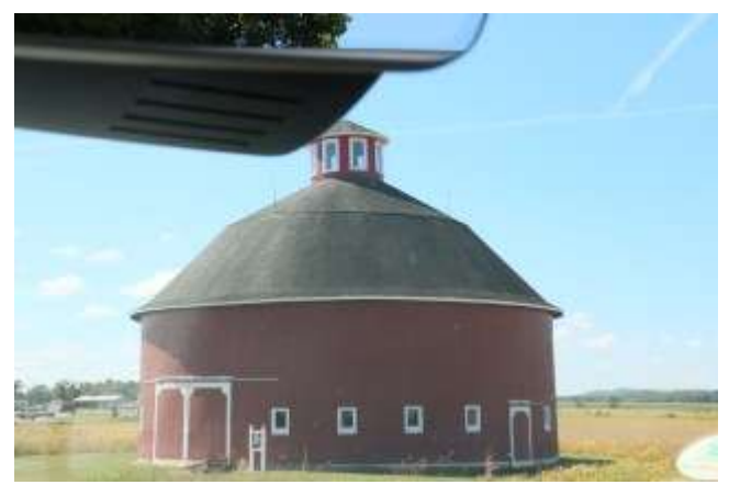
Beautiful round barn