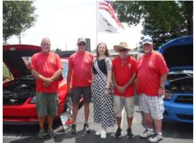
The guys just had to have their picture with the Brickyard 400 Princess.