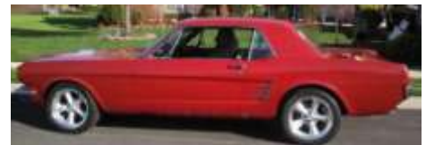
Shermagne Livingston - 1966 Mustang Coupe - Jeffersonville, IN