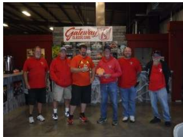
Receiving the award.