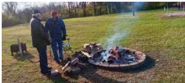
Nice warm fire