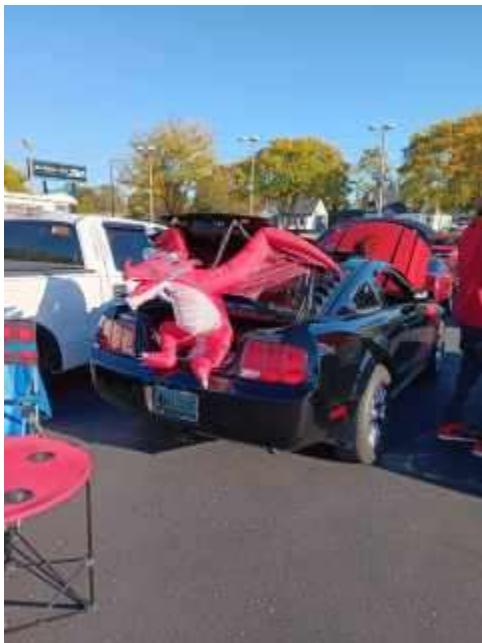
Dragon flying out of Jim's trunk