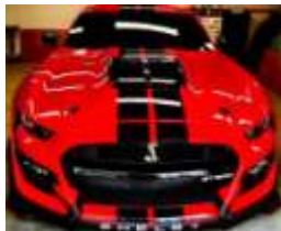
Terry & Verna Sloane - 2022 Mustang Red Shelby GT500 - New Albany, IN