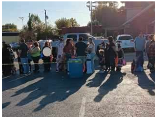
Lots of trick or treaters here!