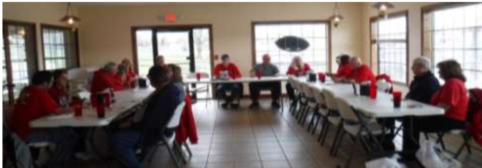
St Nick's Restaurant