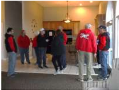
Having donuts before the "Social Distancing"