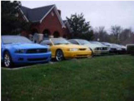
At the clubhouse