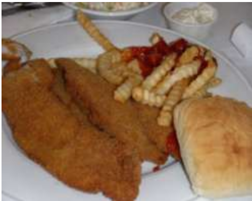
Catfish dinner at St Nick's restaurant