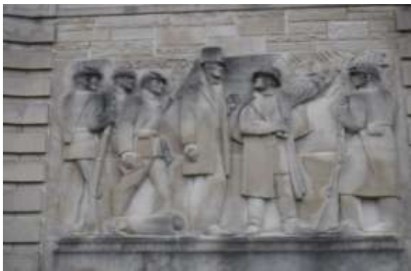
At the Lincoln Memorial