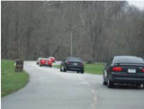
On the road