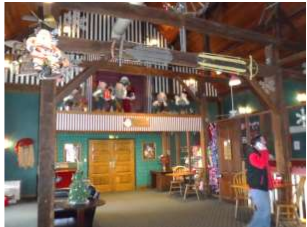
The lobby in Santa's lodge