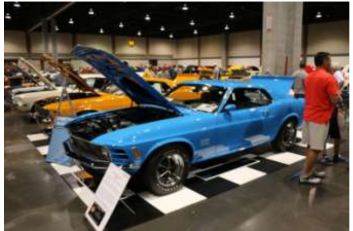
1970 Boss 429 from Greenwood, IN.