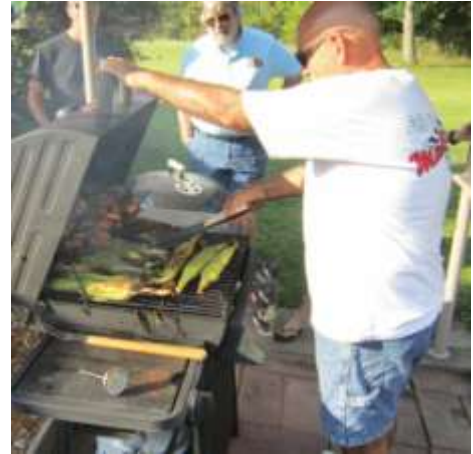
Yum, yum look what's cooking!