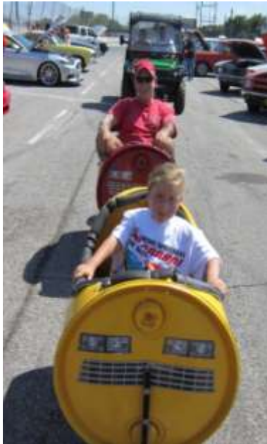
Some kids just won't grow up.