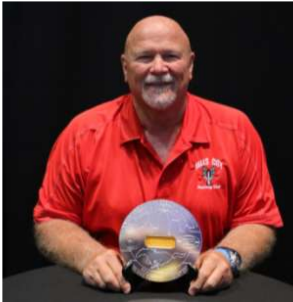
Me with a BIG SMILE!