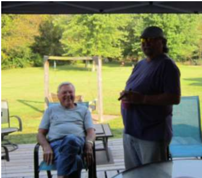
A rare sighting!